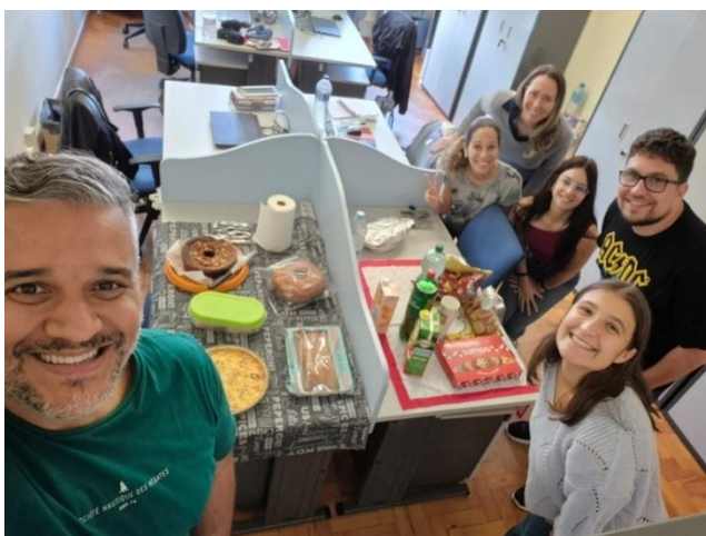
Lunch with my PhD fellow colleagues at the beginning of the stay and the school year.

During my stay, I also had the opportunity to meet other PhD students from different nationalities in different stages of development of their projects. Having formal and informal talks with other peers who are living similar experiences during their PhD journey made my stay very pleasant, since I felt understood,