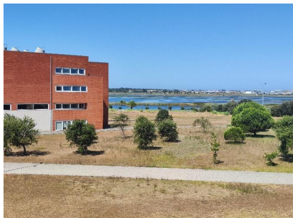
Views of the Campus (UA), from the office.

My research is focused on analyzing the secondary students' performance on systems thinking (ST) and critical thinking (CT) using the 'One Health' (OH) approach in health controversies. The first two years of my PhD project were mainly focused on studying how ST can be fostered in secondary education students during the learning of complex health issues. This research stay was done at a perfect moment within my PhD project, right after starting to draft a competence framework for CT, as a starting point to research about how CT can be fostered during science education by using complex health issues addressed from the OH approach. For this purpose, I had the privilege to visit Dr. Rui M. Vieira, from the University of Aveiro (UA), who provided highly insightful discussions about CT and enormously enriched my PhD project.