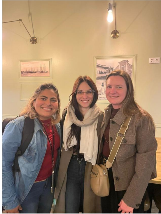
Images of my 'good-bye' party with my PhD fellow colleagues before finishing my stay in Aveiro.